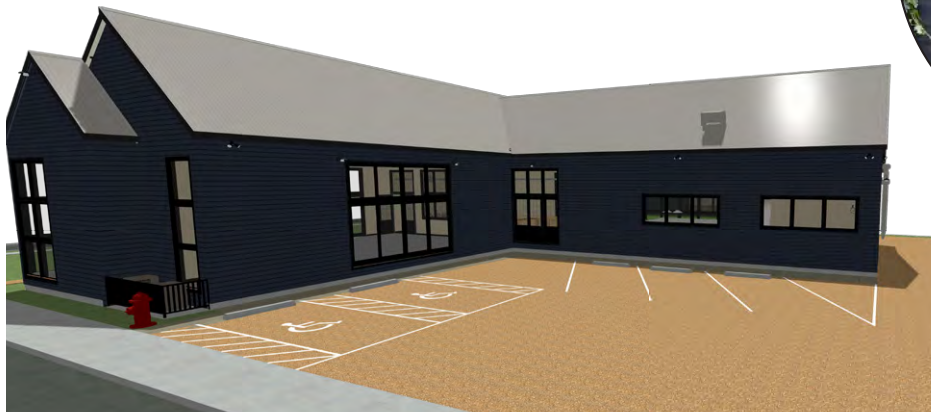
CHERRY STREET PERSPECTIVE (WEST)