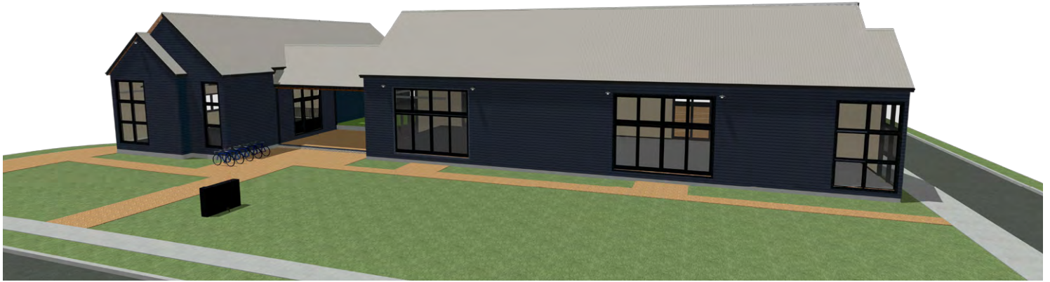
MAIN STREET PERSPECTIVE (NORTH)